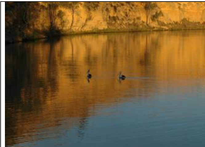
Sunset on the Murray